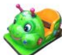
Worm Car 虫虫车 NF-K57 Dimension(W x D x H): 1460 x 1000 x 800MM Power: 12V/100W/60A