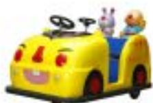
Cartoon Car 豪华卡通车 NF-K22 Dimension(W x D x H): 1450 x 1000 x 900MM Weight: 80KG Power: 80W