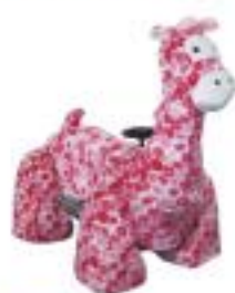
Giraffe 长颈鹿 NF-K27

Dimension(W x D x H): 1000 x 700 x 950MM