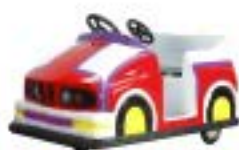
Mini BMW 迷你宝马 NF-K23 Dimension(W x D x H): 1450 x 1000 x 800MM Weight: 80KG Power: 80W