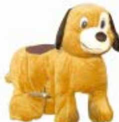
Cute Dog 聪明狗 NF-K25

Dimension(W x D x H): 1200 x 660 x 880MM