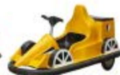
Formula Battery Car 方程式赛车 NF-K56 Dimension(W x D x H): 1180 x 600 x 610MM Power: 12V/100W/60A