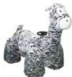
Zebra 斑马 NF-K26

Dimension(W x D x H): 1000 x 700 x 950MM