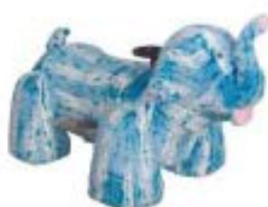
Elephant 大象 NF-K30