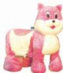
Pink Mouse 粉红鼠 NF-K32

Dimension(W x D x H): 1200 x 660 x 880MM