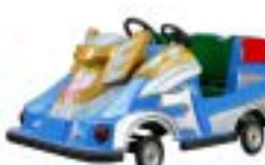
Transformer 变形金刚 NF-K24 Dimension(W x D x H): 1450 x 1000 x 800MM Weight: 80KG Power: 80W