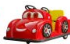
The little Red Car 小红车 NF-K55 Dimension(W x D x H): 1460 x 1000 x 750MM Power: 12V/100W/60A