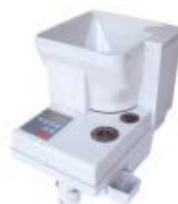
数币机 NF-SP20 Coin Counter(GX-4300)